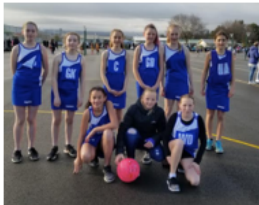
The Pukeko netball team

We would like to celebrate the success of the Fairfield Pukekos netball team who placed second in their netball grade. Well done on a fantastic season.